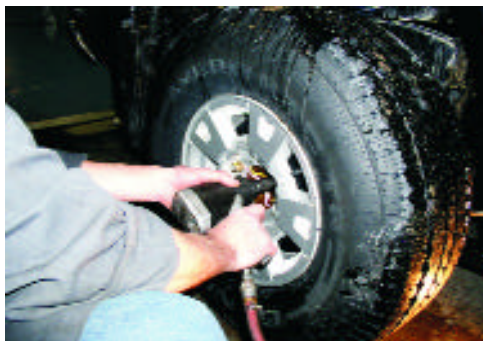
c) Remove wheel assembly.