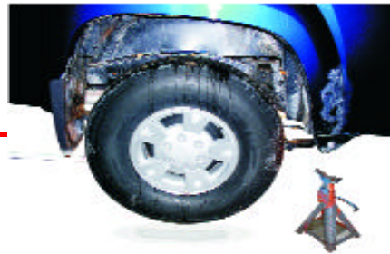
b) Position safety stands to secure vehicle.