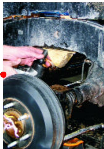
d) Remove OEM bump stop.